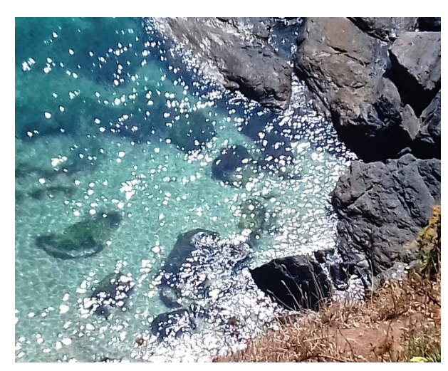
Come ... come to the water